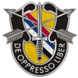
39th Crest Flash