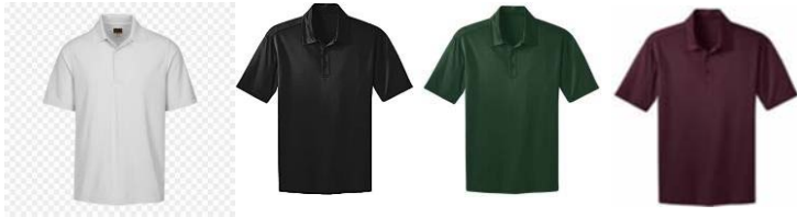
Port Authority "Silk Touch" Performance Polo K540